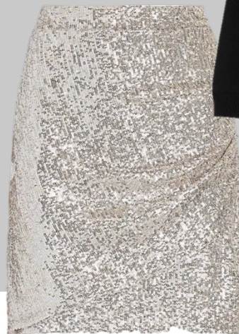
Skirt by Express $88