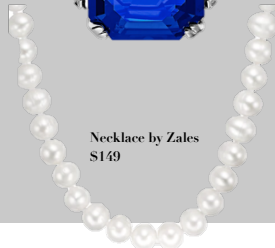
Necklace by Zales $149