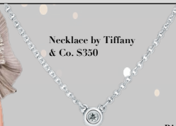
Necklace by Tiffany & Co. $350