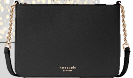
Bag by Kate Spade $239