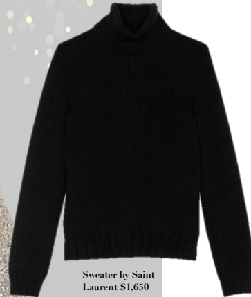
Sweater by Saint Laurent $1,650