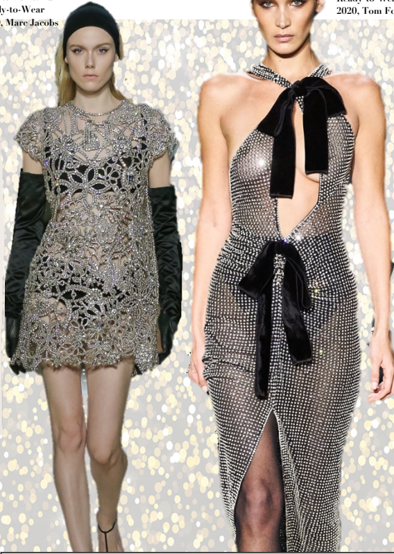
Bella Hadid. Fall Ready-to-Wear 2020, Tom Ford