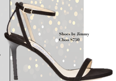
Shoes by Jimmy Choo $750