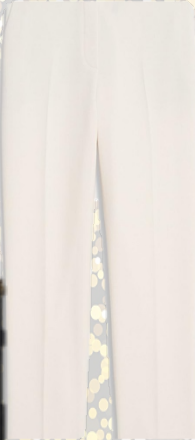
Pants by Theory $295